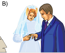
FANCY DRESS PARTY