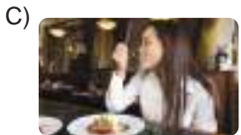
The girl is at the library.