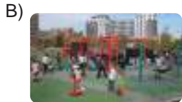
There are some children in the playground.